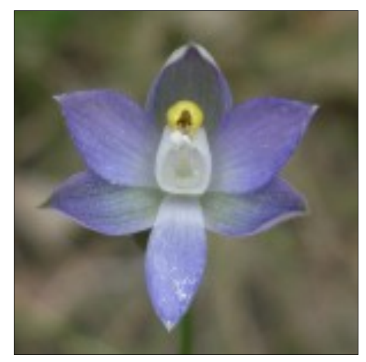
Thelymitra pauciflora