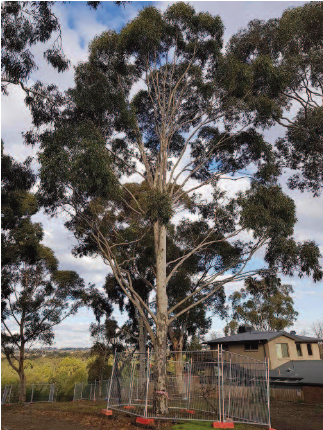
One of the five significant gums at risk of removal on the Banyule House property.

Dinner will be followed by a talk from Rachel Lynskey, from Friends of the Earth, about the 'Get on Board' campaign and the development of a sustainable community transport plan for Melbourne.