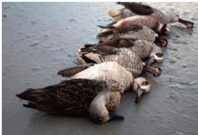
Seven of the victims left by shooters at Cundare Pool on 14th June