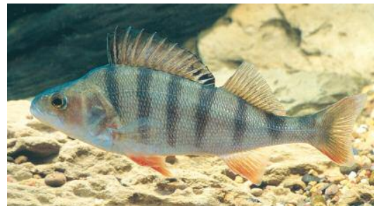
English Perch (Redfin)

Poster of Australian fish from Tim Curmi's presentation