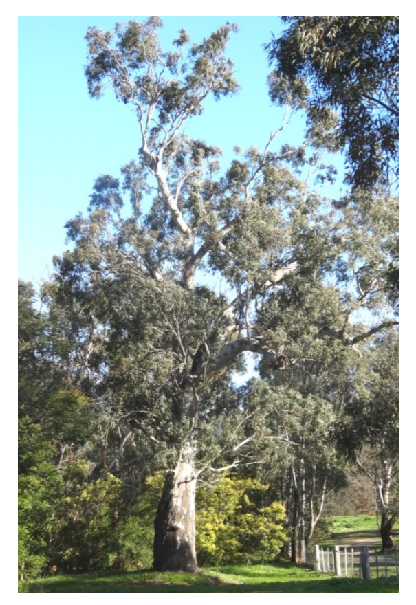
1. 300+ year old remnant River Red Gum near the southern gate in the Banyule Billabong fence.

Eucalyptus X studleyensis (Studley Park Gum) located adjacent to the northern gate in the Banyule Billabong fence. "Significant due to its landscape, botanical, remnant and habitat value as well as it s form, size and age. This tree has outstanding form and is superior to most other ES04 listings. It is likely of state significance." Photo 3.