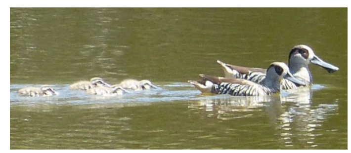
Pink-eared Ducks with ducklings on Banyule Swamp.