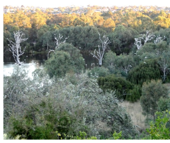
2. Row of dead River Red Gums in Banyule Swamp covered with birds.