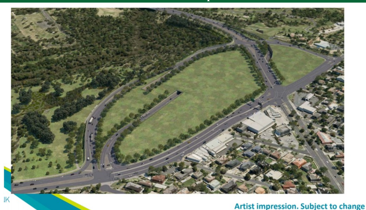
Land set aside for TBM launch site at Manningham Rd