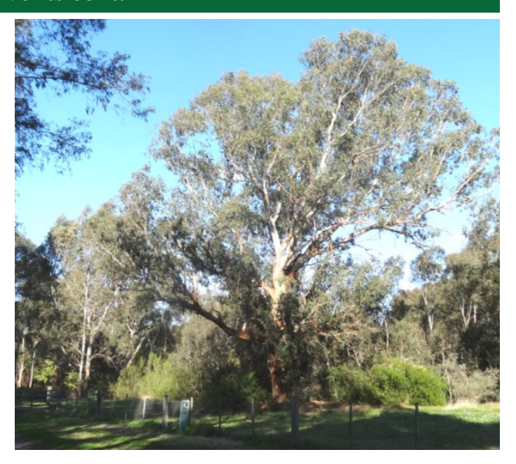
3. Large Studley Park Gum near the northern gate in the Banyule Billabong fence.

The Register of individual trees, groups of trees and areas of vegetation in Banyule that have been assessed as having special significance can be viewed on the BCC website https://www.banyule.vic.gov.au/Council/Environment-and-Sustainability/Trees-and-Plants/Significant-Tree-Register