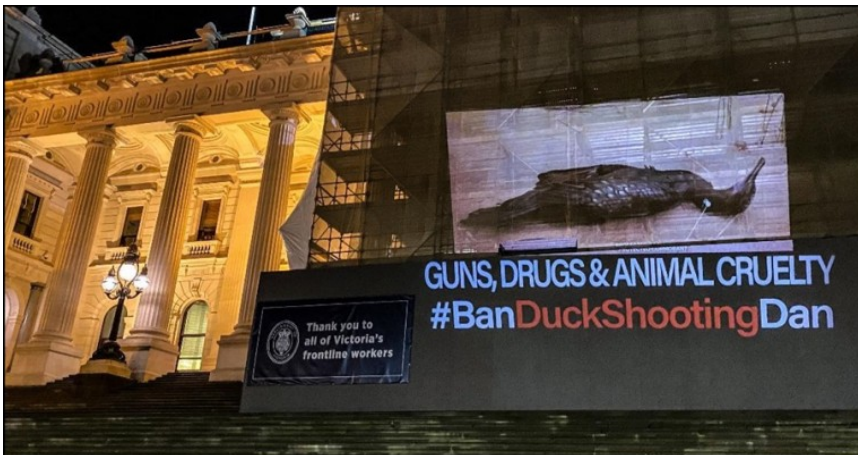
An image projected onto scaffolding outside Victoria's Parliament House after the opening of the duck shooting season this year