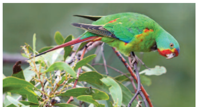
Swift Parrot.